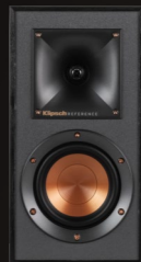
R-41M MONITOR SPEAKERS