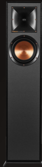
R-610F FLOORSTANDING SPEAKER