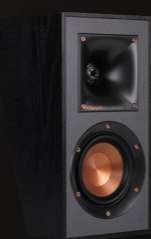
R-41SA SURROUND SPEAKERS WITH DOLBY ATMOS® TECHNOLOGY DOLBY ATMOS