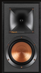
R-51M MONITOR SPEAKERS