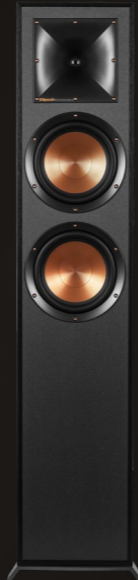
R-625FA FLOORSTANDING SPEAKER WITH DOLBY ATMOS® TECHNOLOGY DOLBY ATMOS