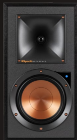
R-51PM POWERED MONITOR SPEAKERS Bluetooth