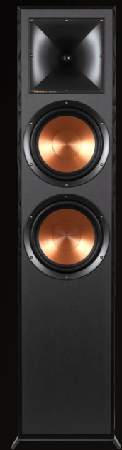
R-820F FLOORSTANDING SPEAKER