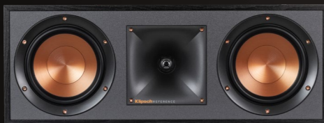
R-52C CENTER SPEAKER